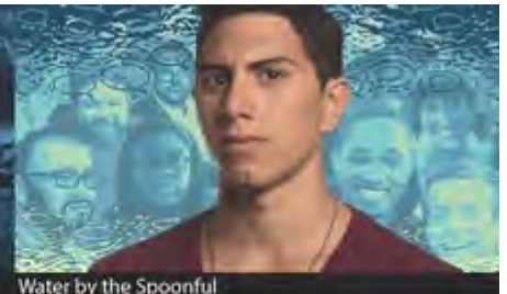
Water by the Spoonful