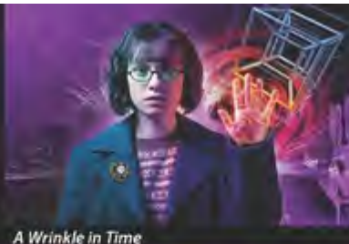
A Wrinkle in Time