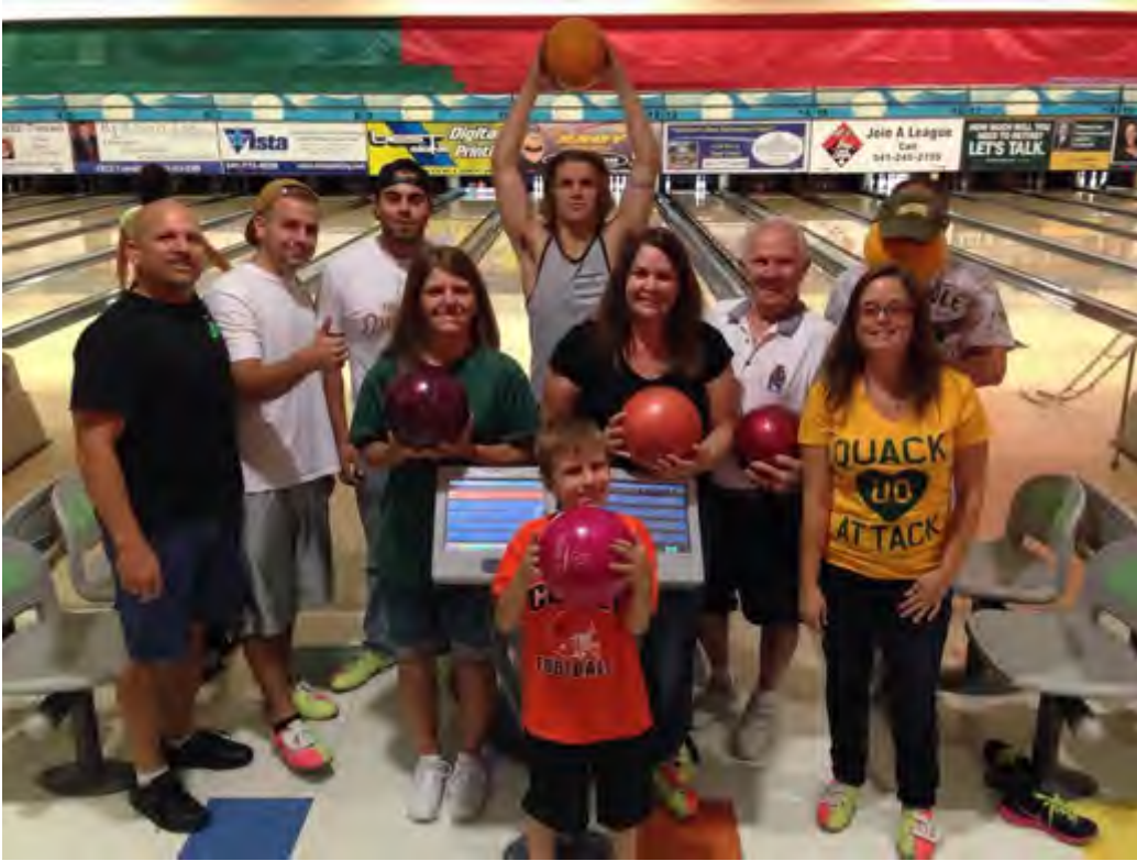
Above: group photo. Can you guess which person? Let us know on our Facebook page!